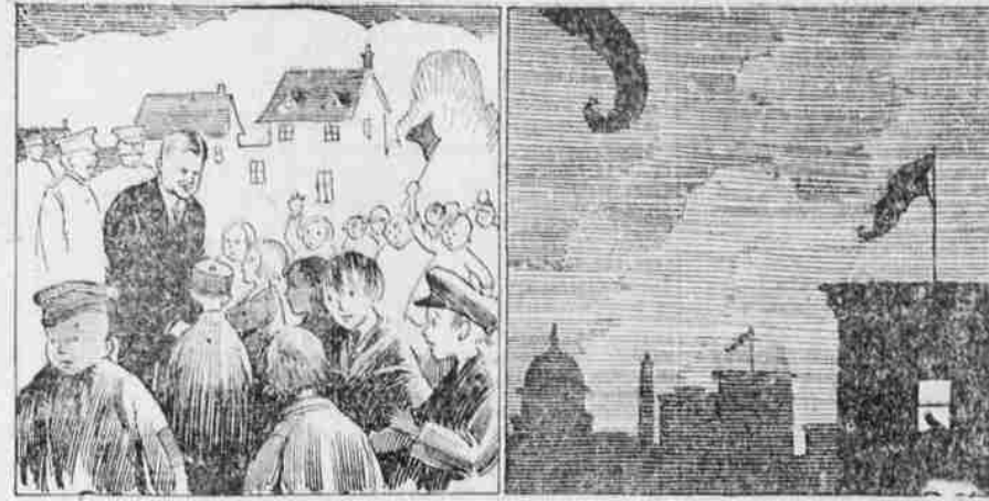
2. He turned his attention to economic restoration of Europe and relief of starving millions.