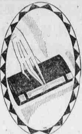
THIS IS MOLYNECK'S new black suede envelope with interesting border of red composition at the closing edge.