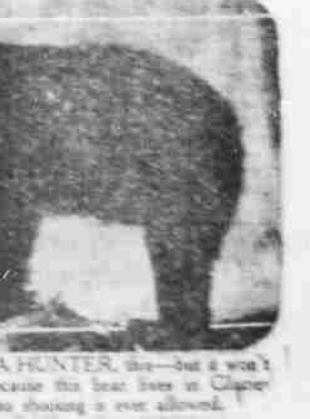
A GREAT SIGHT FOR A HUNTER, this—but a wolf's do the hunter are good, because the bear lives in Glacier National Park where no shooting is ever allowed.

NEWTON, Mass., Sept. 5 (AP)—Hagen and Sarazen were the top amateurs in the world today. Hagen is a first class golfer and Sarazen is a first class golfer. They are the top amateurs in the world today.