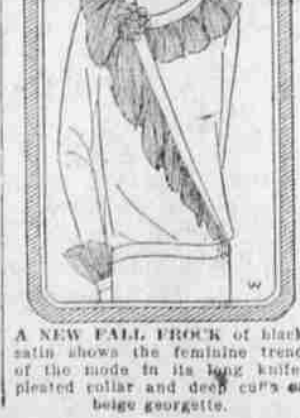
A NEW FALL FROCK of black satin shows the feminine trend of the mode in its long knife-pleated collar and deep cuffs of beige georgette.

Buy Fewer Pianos LONDON (AP) —Popularity of the phonograph and changes in fashion are blamed for a decline in British imports of musical instruments this year. The decrease being especially noticeable in pianos and organs. More musical instruments of other types were imported, but the value was less than usual.