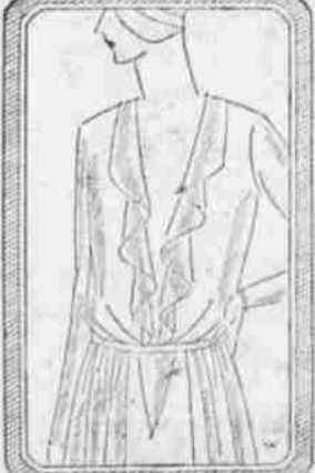
THE NORMAL WAISTLINE and the gathered circular skirt recently seen at a fashionable gathering show the new fashion trends.

U. S. National Bank Member Federal Reserve System