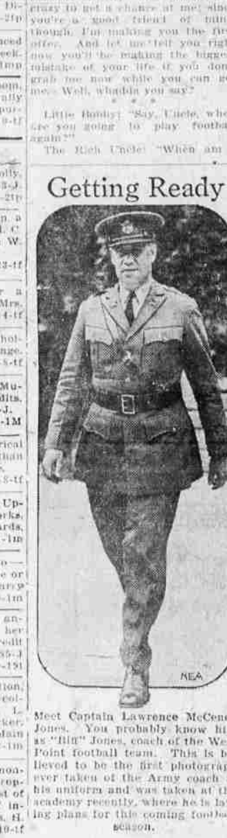
Meet Captain Lawrence McConcy Jones. You probably know him as "Big" Jones, coach of the West Point football team. This is believed to be the first photograph ever taken of the Army coach in his uniform and was taken at the academy recently, where he is laying plans for this coming football season.