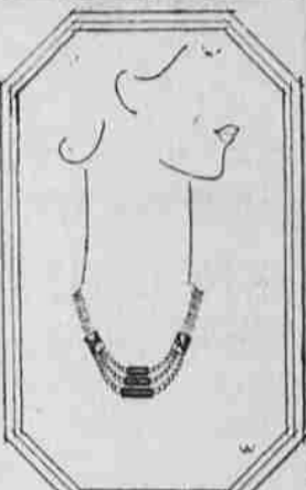
THREE LARGE BEADS of lapis lazuli are joined with strands of pearls and two carved silver motifs to a silver mesh necklace, a new note in jewelry.

NOT AMUNDSEN'S WRITING OSLO, Norway, Aug. 18. (AP)—A nephew of Roald Amundsen, who acted as secretary to his famous uncle, says that the handwriting of a letter found Aug. 11 by Dutch fishermen off the coast of Groningen, Holland, bears no resemblance to that of the missing explorer. The alleged message read: "Latham 1-7-28, 84 degrees 23 minutes east. Roald Amundsen seen."