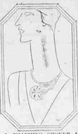
A CHARMING CHOKER for evening, simulating a flower and stem wound around the throat, is of gold with flower and bud of rose quartz.