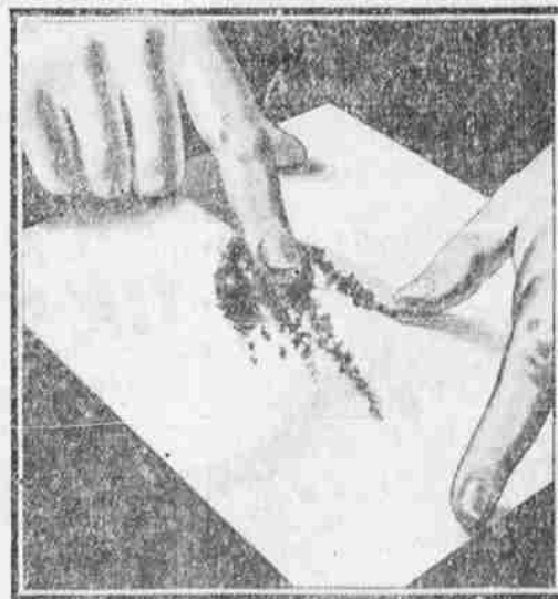
Carbon deposited by ordinary oil is hard, flinty. It will tear paper; it will scratch brass—wear away steel.