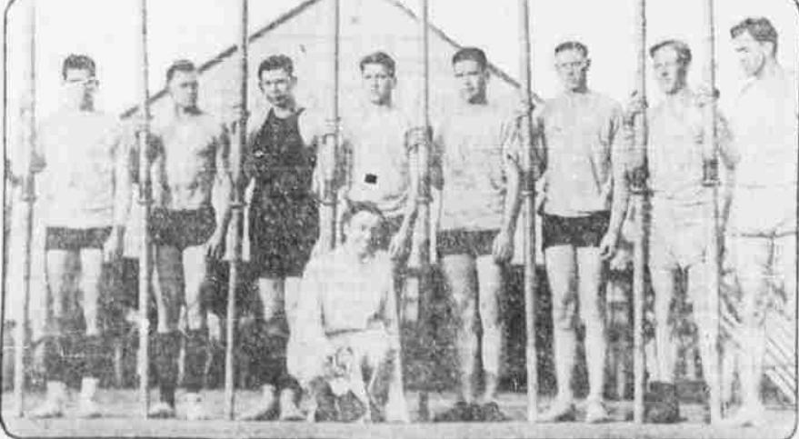
The University of California eight-oared crew, pictured above, won the blue ribbon event of the Olympic regatta for the U. S. today by defeating the English crew in the final for the world championship. The Golden Bears have not been defeated this year, winning every event in which they participated.