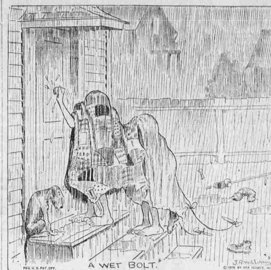
A WET BOLT.