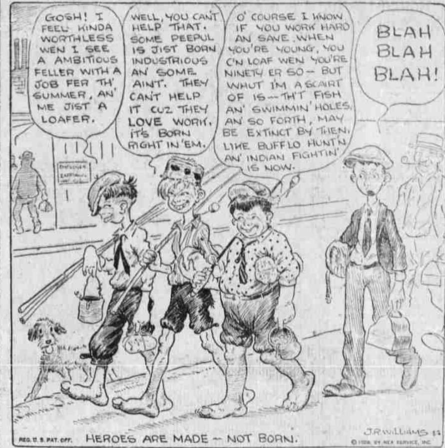
REG. U. S. PAT. OFF. HEROES ARE MADE - NOT BORN.