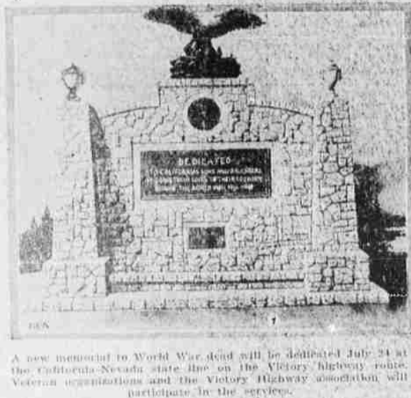
A new memorial to World War dead will be dedicated July 24 at the California-Nevada state line on the Victory Highway route. Veteran organizations and the Victory Highway association will participate in the services.