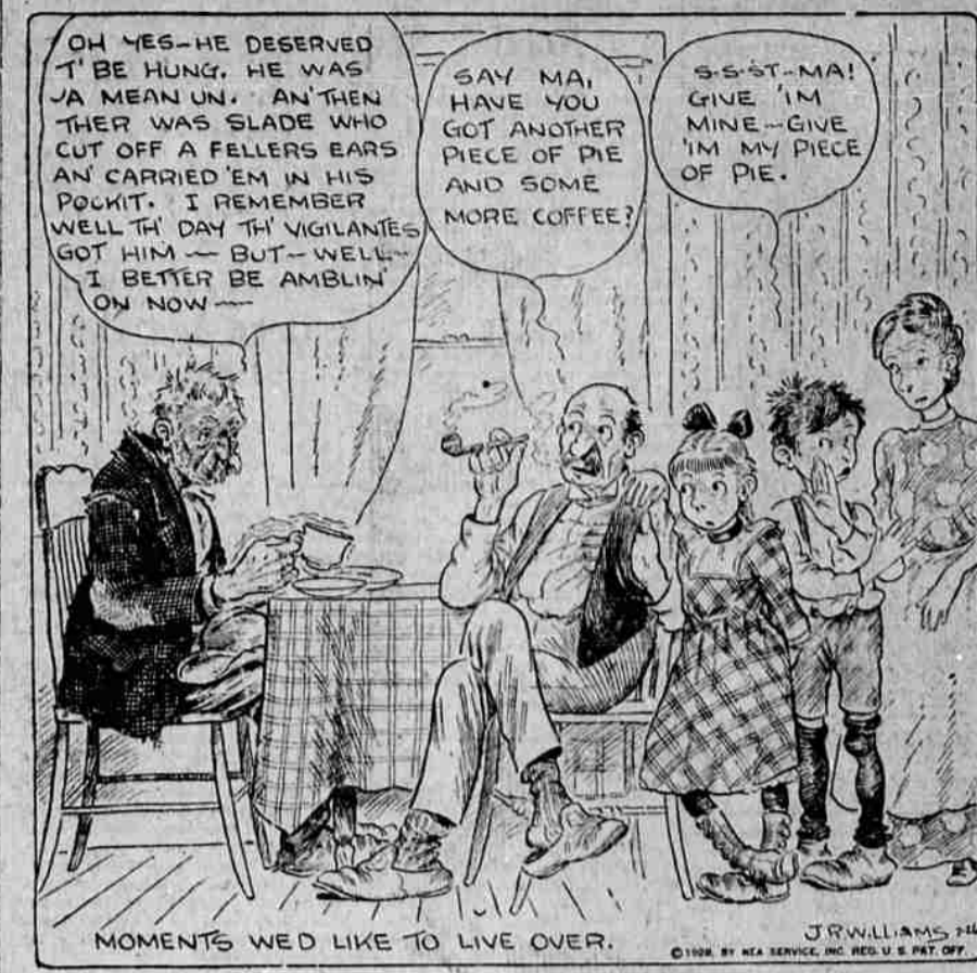
MOMENTS WED LIKE TO LIVE OVER.

OH YES—HE DESERVED T'BE HUNG. HE WAS JA MEAN UN. AN THEN THER WAS SLADE WHO CUT OFF A FELLERS BARS AN CARRIED 'EM IN HIS POKKIT. I REMEMBER WELL TH' DAY TH' VIGILANES GOT HIM — BUT — WELL — I BETTER BE AMBLIN' ON NOW