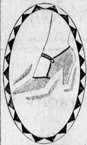
SHOES OF TWEED to match the costume are a new innovation for fall. The heel and edges are of matching kid.