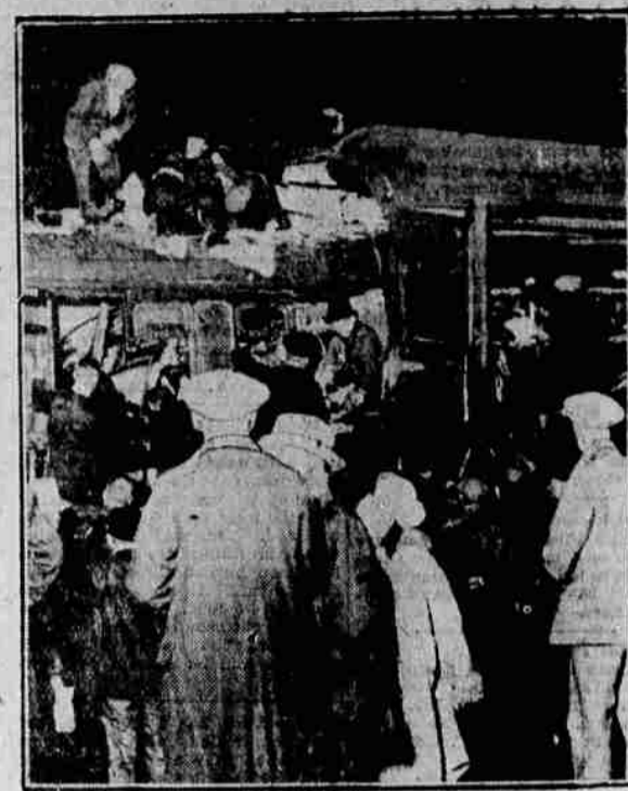
This extraordinary photo, taken shortly after one of the most serious railroad accidents in English history, shows rescue workers cutting their way through sides and top of the telescoped coaches. A crowded night excursion train collided with a freight train at Darlington, killing 22 persons and injuring scores.