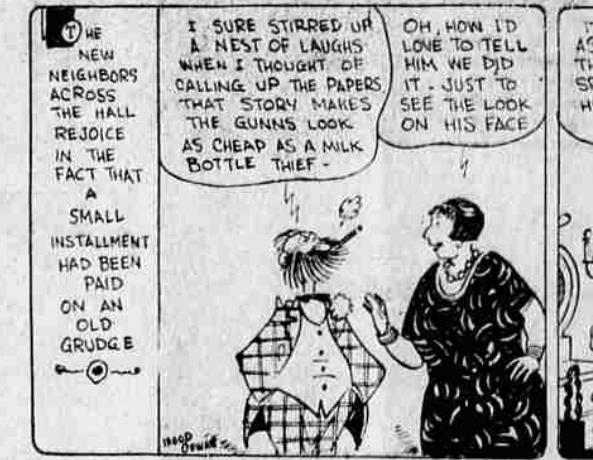
I SURE STIRRED UP A NEST OF LAUGHS WHEN I THOUGHT OF CALLING UP THE PAPERS THAT STORY MAKES THE GUNNS LOOK AS CHEAP AS A MILK BOTTLE THIEF.