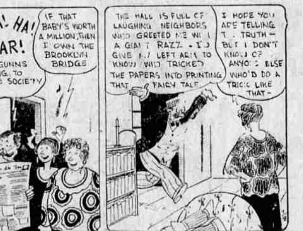
THE HALL IS FULL OF LAUGHING NEIGHBORS WHO GREETED ME WITH A GIANT RAZZ. I'VE GIVE 'EM LEFT ARMS TO KNOW WHO TRICKED THE PAPER INTO PRINTING THAT FAIRY TALE.