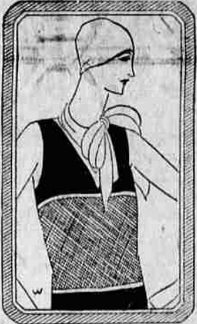
A TWO-TONED BLUE jersey bathing suit has a white silk kerchief set in with a point, matching the white bands that divide the blues.

The spring bathing-season will be officially opened in La Grande today when Fanchon and Marco's "Diving Venus Idea" opens its engagement at the Arcade theater. A parade of Fanchon and Marco's most beautiful girls exhibiting the latest in beach and swimming fashions will be one of the features of the "idea." According to the producers all the girls will be Venuses, hence the name "Diving Venus" Idea. Two giant glass tanks are necessary for the presentation of Fanchon and Marco's "Diving Venus" idea. In order to construct tanks large enough for the "idea" and which would safely hold the seven thousand gallons of water, it was found that the time in setting them up would take too long. Not to