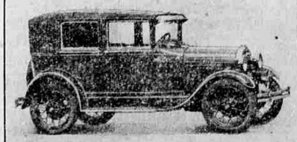
This is the new Fordor sedan of the Model A Ford line. It will be on display in dealer showrooms shortly.