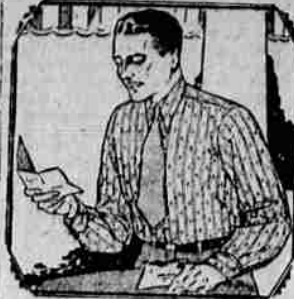
As Cheery as a Bright June Day—