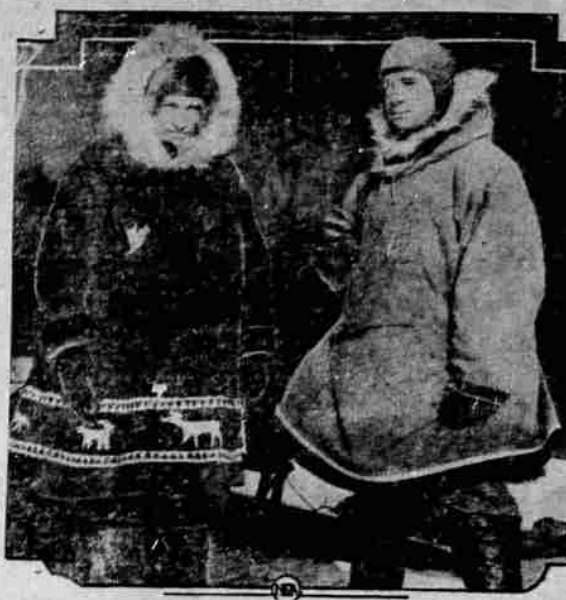
Here is the first picture to reach the United States of Lieut. Carl B. Eielson (left) and Capt. George H. Wilkins as they were preparing at Point Barrow, Alaska, to take off on their successful flight across the north pole region to Spitzbergen.