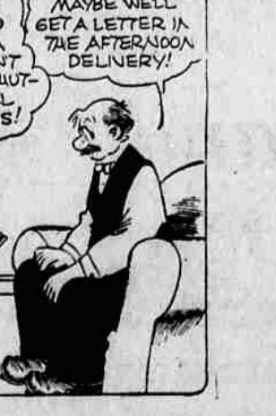
MAYBE WE'LL GET A LETTER IN THE AFTERNOON DELIVERY!