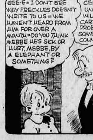
GEE-E-I DON'T SEE WHY FRECKLES DOESN'T WRITE TO US-WE HAVEN'T HEARD FROM HIM FOR OVER A MONTH-DO YOU THINK MEBBE HE'S SICK OR HURT, MEBBE, BY A ELEPHANT OR SOMETHING?