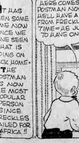
IT HAS BEEN SOME TIME NOW SINCE WE HAVE SEEN WHAT IS GOING ON BACK HOME. THE POSTMAN IS NOW THE MOST POPULAR PERSON SINCE FRECKLES SAILED FOR AFRICA!!