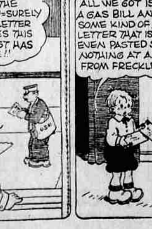
ALL WE GOT IS A GAS BILL AND SOME KIND OF A LETTER THAT ISN'T EVEN PASTED SHUT-NOTHING AT ALL FROM FRECKLES!