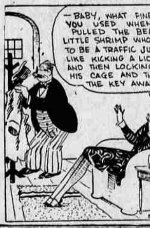
BABY, WHAT FINE JUDGMENT YOU USED WHEN YOU PULLED THE BEARD OF A LITTLE SHRIMP WHO TURNS OUT TO BE A TRAFFIC JUDGE. THAT'S LIKE KICKING A LION IN THE FACE AND THEN LOCKING YOURSELF IN HIS CAGE AND THROWING THE KEY AWAY