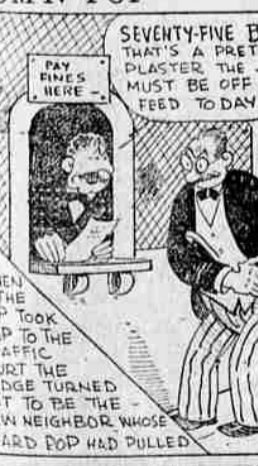
SEVENTY-FIVE BUCKS! THAT'S A PRETTY STIFF CLASHER. THE JUDGE MUST BE OFF HIS FEED TO DAY - THIS