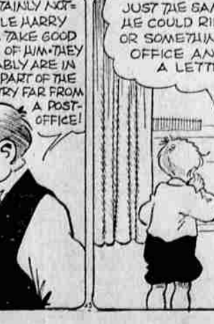
CERTAINLY NOT-UNCLE HARRY WILL TAKE GOOD CARE OF HIM-HEY PROBABLY ARE IN SOME PART OF THE COUNTRY FAR FROM A POST-OFFICE!