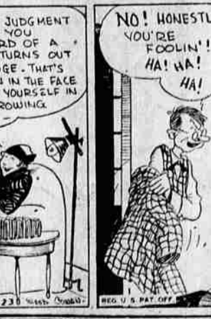
NO! HONESTLY? NO SIR, I TELL YOU THE NEW NEIGHBOR THAT POP HAD THE SCRAP WITH WAS THE JUDGE, AND HE SLAPPED A $75 FINE ON POP FOR A $5 OFFENSE