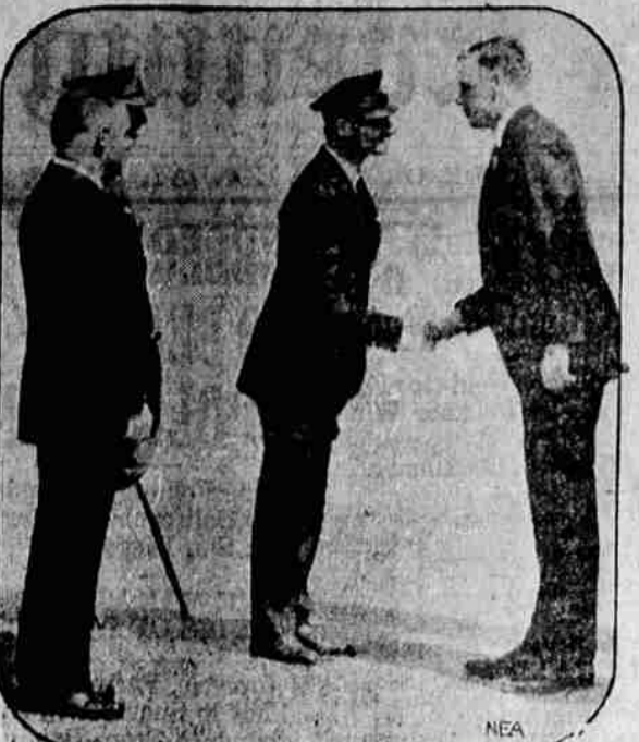
The meeting of the men who crossed the Atlantic ocean from east to west with the man who crossed it from west to east is pictured here, as our own Hero Colonel Lindbergh shakes the hand of Baron von Huenefeld of the Bremen. To the left stand Captain Hermann Koehl, (foreground) and Major James Fitzmaurice, waiting to receive their congratulations from America's ace of aces. The meeting was at Bolling field, Washington.