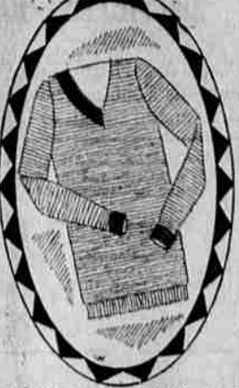
A yellow woolen sweater has a modernistic treatment at the neckline, one side of which is applied with strips of dark yellow crepe de chine. The cuffs, which button, also have strips of the silk.