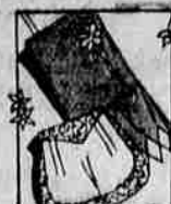
RAYON undies by Hellette are here now in every style and color—V-front bloomers, French pants, combination and athletic suits. Beautiful garments.

Style is one thing—and material and making is another. It's our opinion that these new spring frocks of figured chiffons and crepes give a remarkable combination of both qualities at this price. New neck lines, uneven hems, pretty side drapes—and every dress tailored to give service.