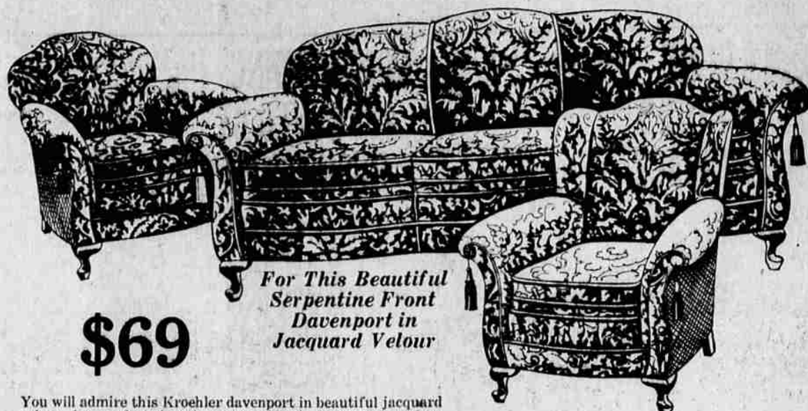
For This Beautiful Serpentine Front Davenport in Jacquard Velour