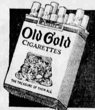
Only the best leaves of the tobacco plant are good enough for OLD GOLD. That's why you can pick them in the dark.