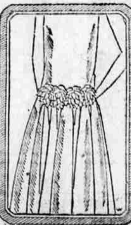
A QUARTET of chiffon flowers are effective on the front of the dress where skirt and bodice meet.

NEBRASKA INCREASE FORAGE LINCOLN, Neb., (AP)—The Nebraska acreage of sweet clover has increased twelve-fold in the last six years, figures at the state agricultural college here reveal. Alfalfa acreage has doubled in 30 years, in spite of heavy losses from winter injury.