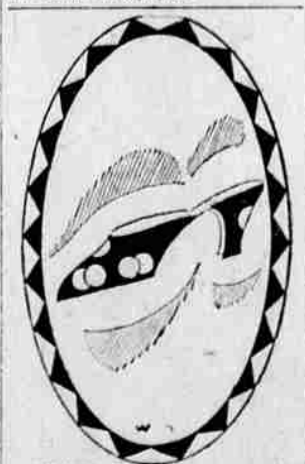
SILVER KID circles applied in careless design lend a chic modern treatment to black satin mules.

Senator Willis of Ohio breaks out in a bitter attack upon the Scripps-Howard publications in Ohio which are supporting Hoover. Perhaps he's just trying to rattle the chain newspapers.