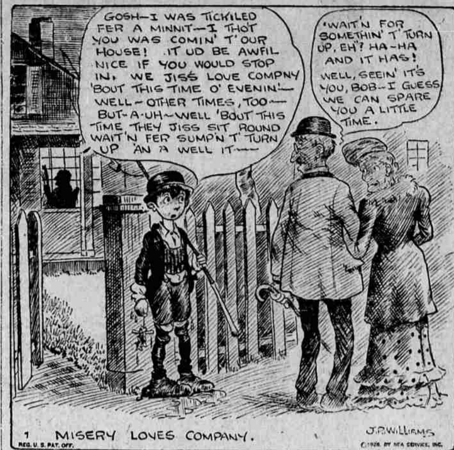
1 MISERY LOVES COMPANY.