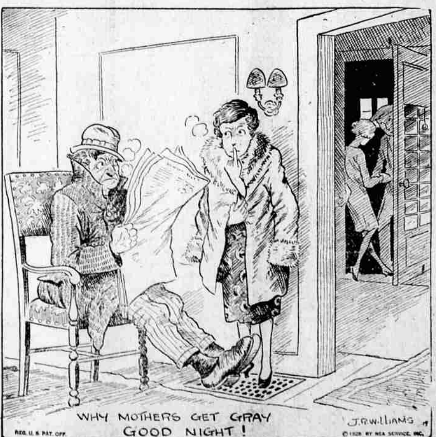
WHY MOTHERS GET GRAY GOOD NIGHT!