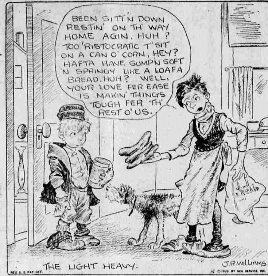
THE LIGHT HEAVY. J.P. WILLIAMS REG. U. S. PAT. OFF. 15 © 1928 BY NEA SERVICE, INC.

without its frames, either hot beds or the cold frames. Miniature frames for early seed raising are one of the most profitable garden investments even if they are not put in place until April. They are now made in half the size of the standard cold frame or hot bed sash which is 3x6 ft. The seed frames are made 2x3 or even 3x1 for convenient handling with the glass on a hinged cover.