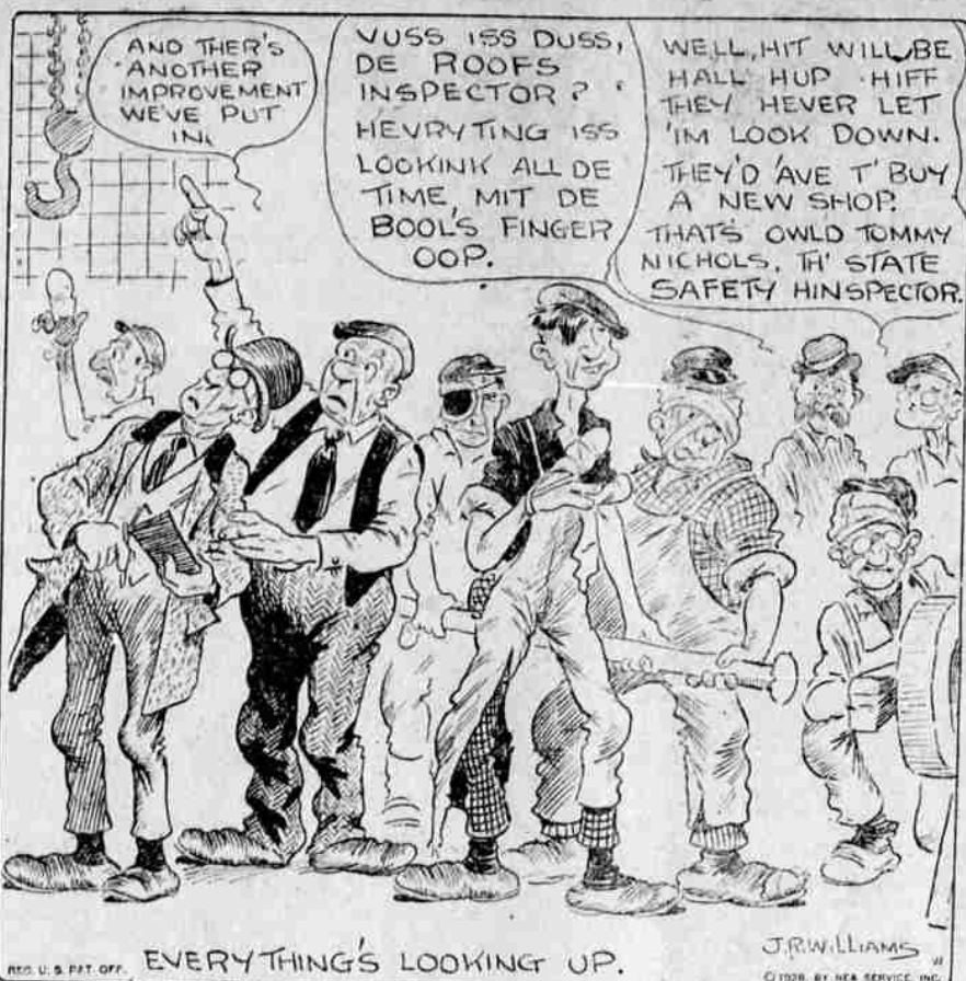
REG. U. S. PAT. OFF. EVERYTHING'S LOOKING UP.