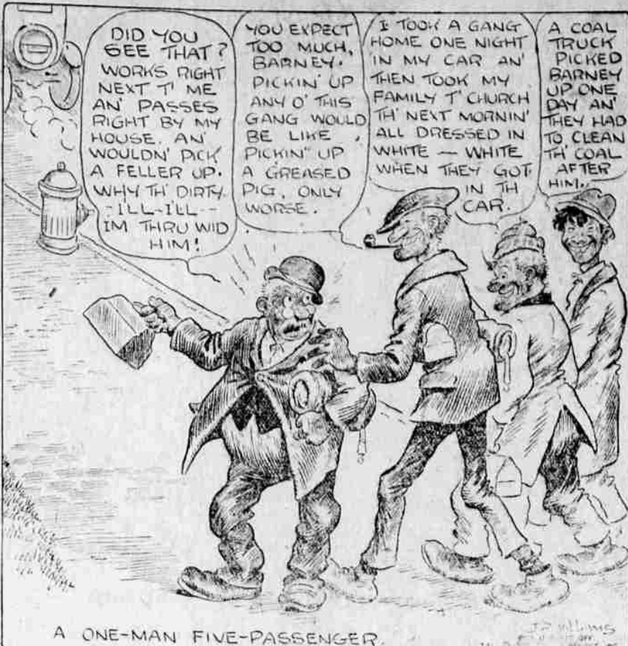
A ONE-MAN FIVE-PASSENGER.

a matter of fact I cannot see any reason why it should not be good. Of course, it is a presidential year but there are no important economic questions before the country and it does not seem likely any will arise, and that being the case I do not think the upset of business resulting from presidential election that used to occur in past years, will be material."