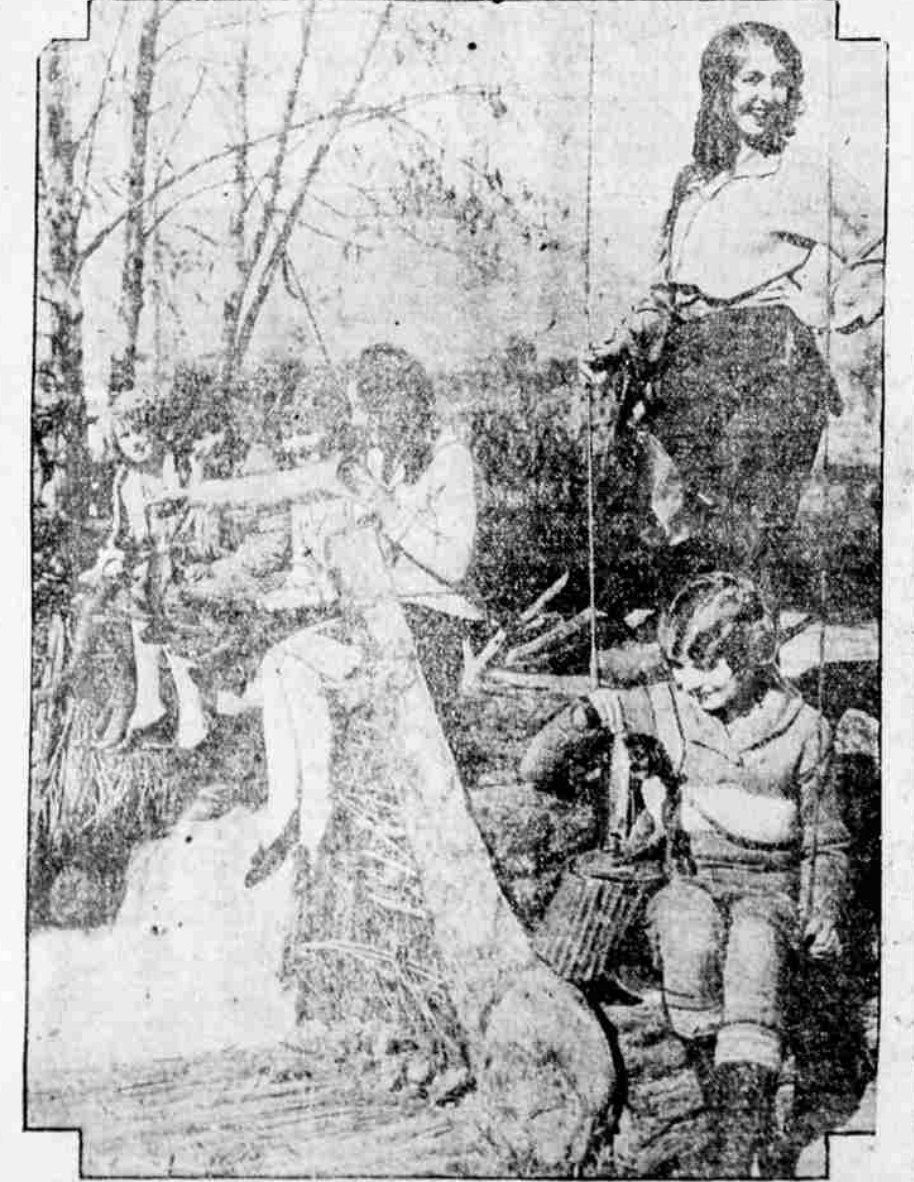
TROUT FISHING IN MIDWINTER has become the popular pastime in Southern California since many angling preserves have been established. Here is a group of Los Angeles devotees whipping one of the streams with fair success.