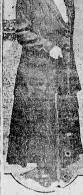
Marie, ex-empress of all the Russias, posed for this photo on her 80th anniversary. She celebrated it in exile in Copenhagen, Denmark.

for Our Clearance Sale Announcement PUTMAN'S La Grande's Exclusive Ready-To-Wear Millinery & Shoes