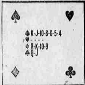
♠ K-J-10-8-6-5-4 ♥ A-K-10-9 ♦ A-J ♣

Yesterday's hand which appears below was given, and six questions were asked concerning it. The questions are repeated in the explanations of my answers.