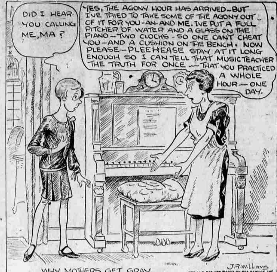
WHY MOTHERS GET GRAY.