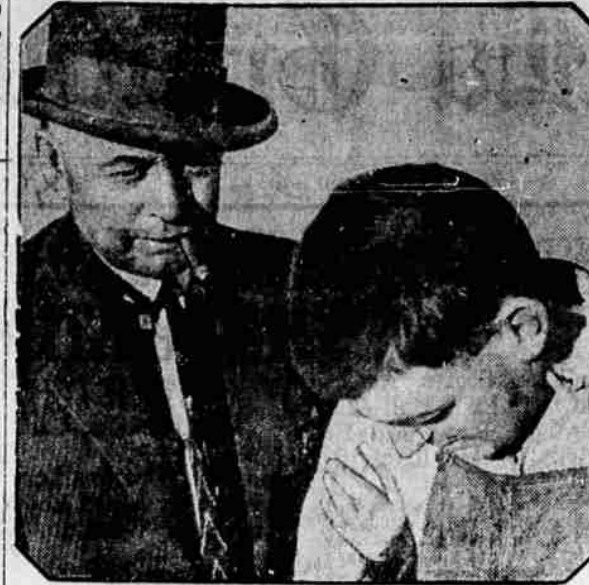
Scenes of violence have been frequent in the strike districts of Colorado. Here one of the miners, struck on the head by a mine guard at Lester mine near Walsenburg, is shown as he tries hard to recover his senses.