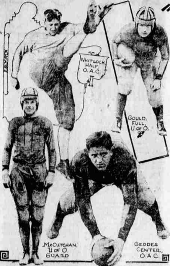
Stars of Oregon and Aggie Elevens

UNIVERSITY OF OREGON, Eugene, Nov. 10 (Special)—Another page of state grid history will be written on the books late Friday afternoon when the football teams of the University of Oregon and Oregon Agricultural college meet on Hayward field here in the 32nd annual fray.