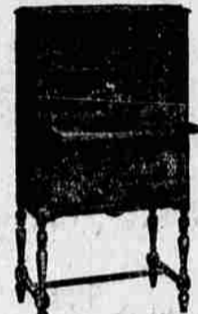
Six Tube Set in Pooley Cabinet Completely Installed

This famous model was the greatest selling set in the United States last season. Now improved in selectivity. Completely installed, specially priced $124