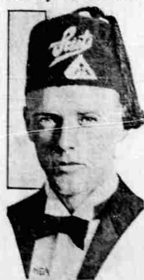
Before Col. Lindbergh left San Diego, Calif., on his hop for Paris he applied for membership in the Scouts. On his recent visit to San Diego his induction was completed. Here he is wearing the fez.