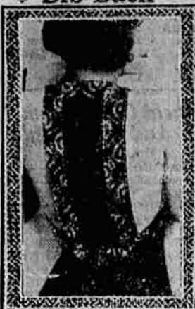
A stunning transparent black velvet gown, with shot gold embroidery, devised an entirely new bib back. It extends its eight-inch width from neck to waistline, leaving the sides bare.