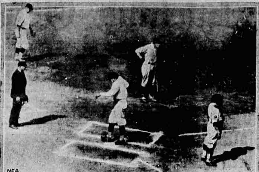
The big thrill of the first 1927 world series game—Babe Ruth crosses home plate in the first inning for the first run of the game, won by the Yanks from Pittsburgh by a score of 5 to 4.