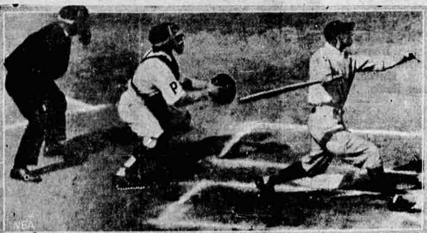
Combs files out to Harnhart in the first inning of the first game between the Yanks and Pirates, won 5 to 4 by the Yanks.