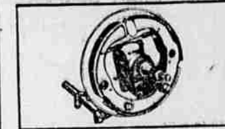
Big 4-Wheel Brakes—First light car to introduce this safety feature.