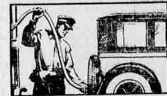
Economy—The Whippet holds A. A. A. Coast-to-Coast economy record.