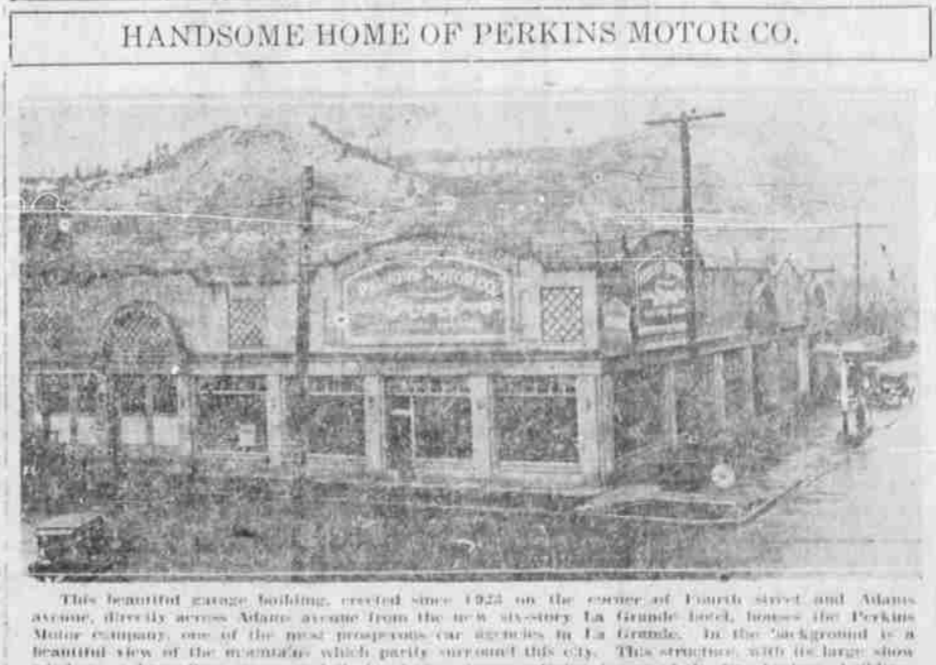
This beautiful garage building, erected since 1923 on the corner of Fourth street and Adams avenue, directly across Adams avenue from the new six-story La Grande hotel, houses the Perkins Motor company, one of the most progressive car agencies in La Grande. In the background is a beautiful view of the mountains which partly surround this city. This structure, with its large show windows, a huge floor space, and its handsome, new exterior, is one of the fine business buildings which gives this city's downtown district a reputation throughout Oregon for its fine business blocks.