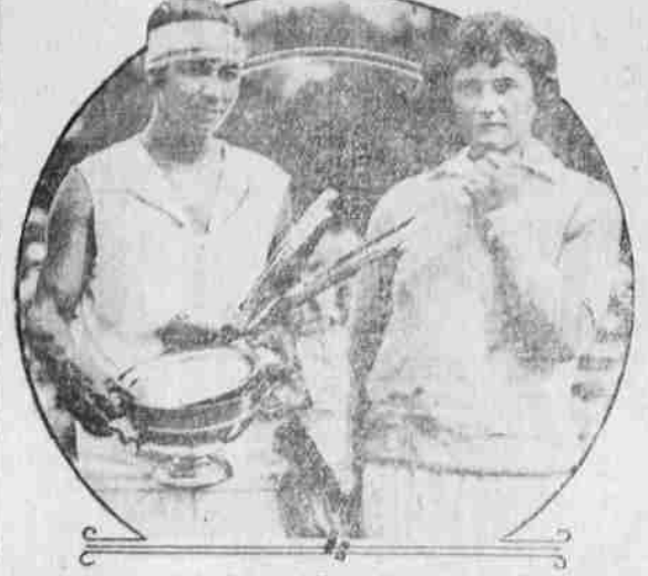
Mrs. Molla B. Mallory, left, and Helen Jacobs, pretty California girls, at the right, are occupying the spotlight in present eastern tennis meets. One of Mrs. Mallory's latest victories, won over Miss Jacobs, was at Beachright. She is holding the trophy won in this photograph. Both are entered in all important eastern meets this season.