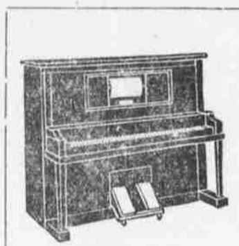
Baldwin — Ellington — Hamilton — Howard Monarch — Manual Players