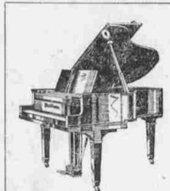
Baldwin — Ellington — Hamilton — Howard Grands and Reproducing.