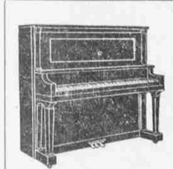
Baldwin — Ellington — Hamilton — Howard Monarch — Pianos