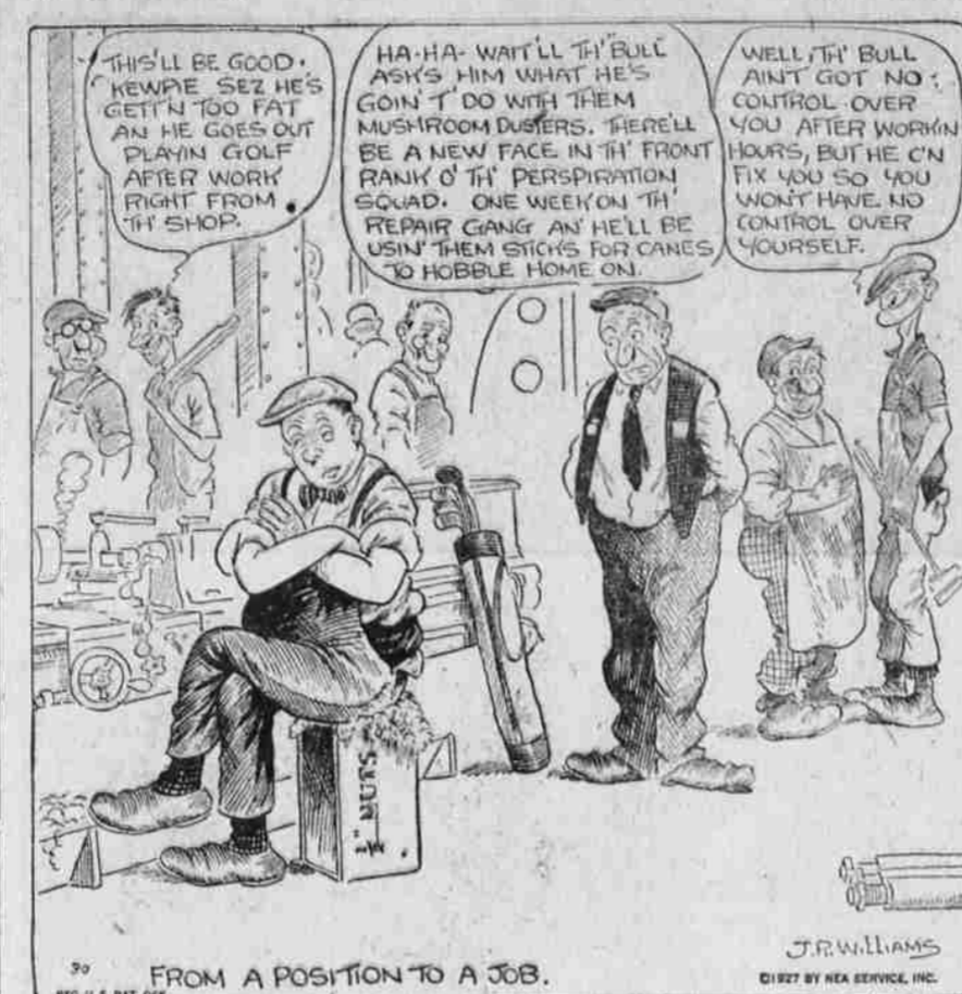
FROM A POSITION TO A JOB. BY WILLIAMS.