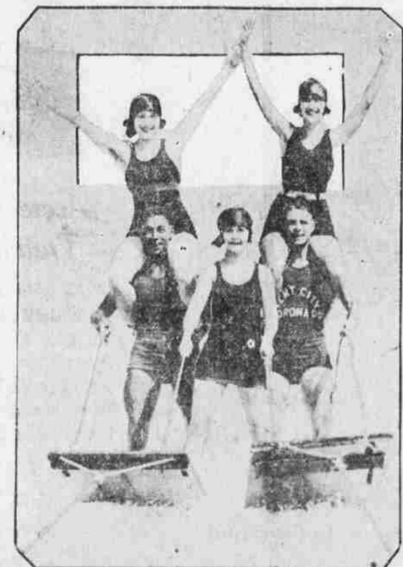
A LITTLE DOUBLE TEAM DRIVING with the aquaplane looks nice—but it's so easy to slip! These society folk of San Diego, Calif., don't seem to fear the consequences, though.