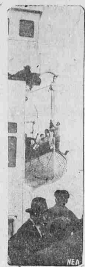
(NEA, New York Bureau) Here photos of a rescue at sea. They illustrate the saving of 25 men from the sinking freighter Sagaland, rammed by the liner Veendam off Nantucket Island. Taken just at dawn, from the Veendam's decks, the pictures show the Sagaland's lifeboats returning to the line with members of the Sagaland's crew. The ships collided in a dense fog, and the Sagaland went to the bottom in 15 minutes. But all except one of her crew were saved.