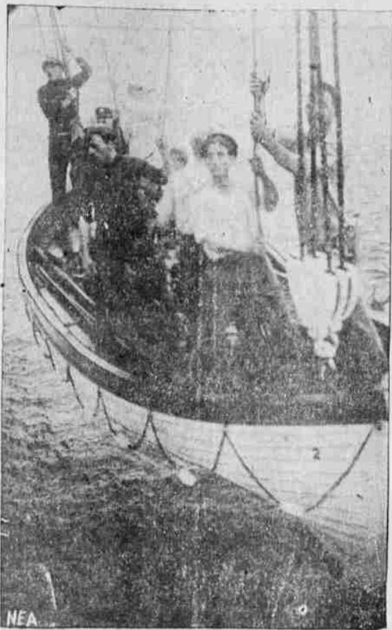
Here photos of a rescue at sea. They illustrate the saving of 25 men from the sinking freighter Sagaland, rammed by the liner Veendam off Nantucket Island. Taken just at dawn, from the Veendam's decks, the pictures show the Sagaland's lifeboats returning to the line with members of the Sagaland's crew. The ships collided in a dense fog, and the Sagaland went to the bottom in 15 minutes. But all except one of her crew were saved.