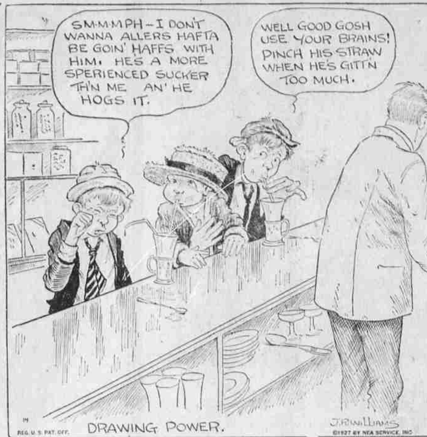
REG. U. S. PAT. OFF. DRAWING POWER. J. R. WILLIAMS, INC. 51927 BY NIA SERVICE, INC.