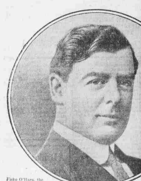
Fiske O'Hara, the pleasing stage star.

"The throat is a delicate instrument which all singers protect with the utmost care. To avoid irritation, I smoke Lucky Strikes. They are not only kind to my throat but have the finest flavor." Fiske O'Hara