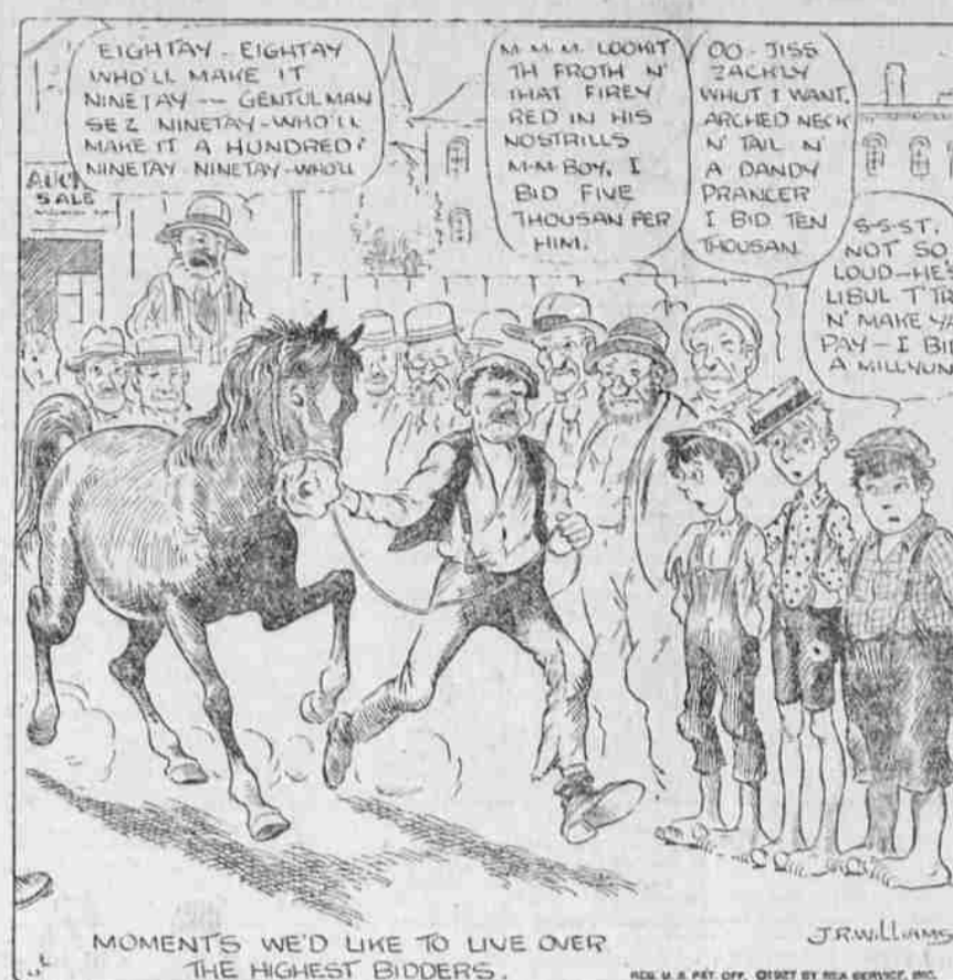
MOMENTS WE'D LIKE TO LIVE OVER THE HIGHEST BIDDERS.