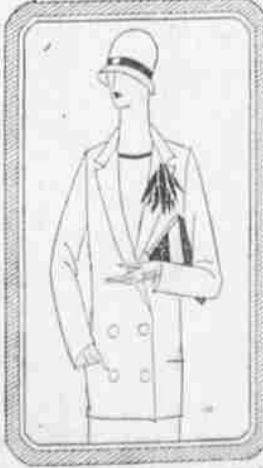
A red felt flower is worn with this smart double-breasted navy blue wool jacket with brass buttons.