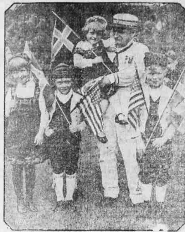
The anniversary of Norway's independence brought 10,000 Americans of Norwegian descent to Humboldt Park, Chicago, where an impressive pageant was held. The children above, garbed in Norwegian costumes, gave native folk dances.